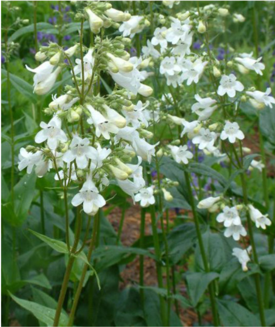
Penstemon digitalis foxglove beardtongue