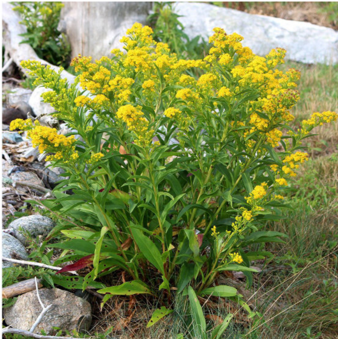
Solidago sempivirens seaside goldenrod