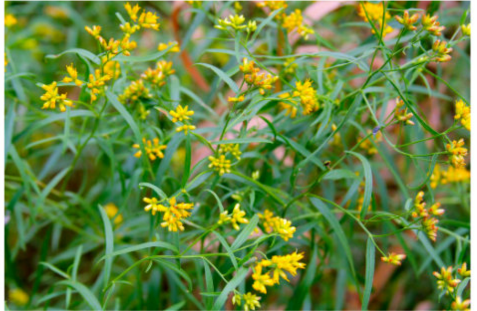
Euthamia graminifolia grass-leaved goldenrod