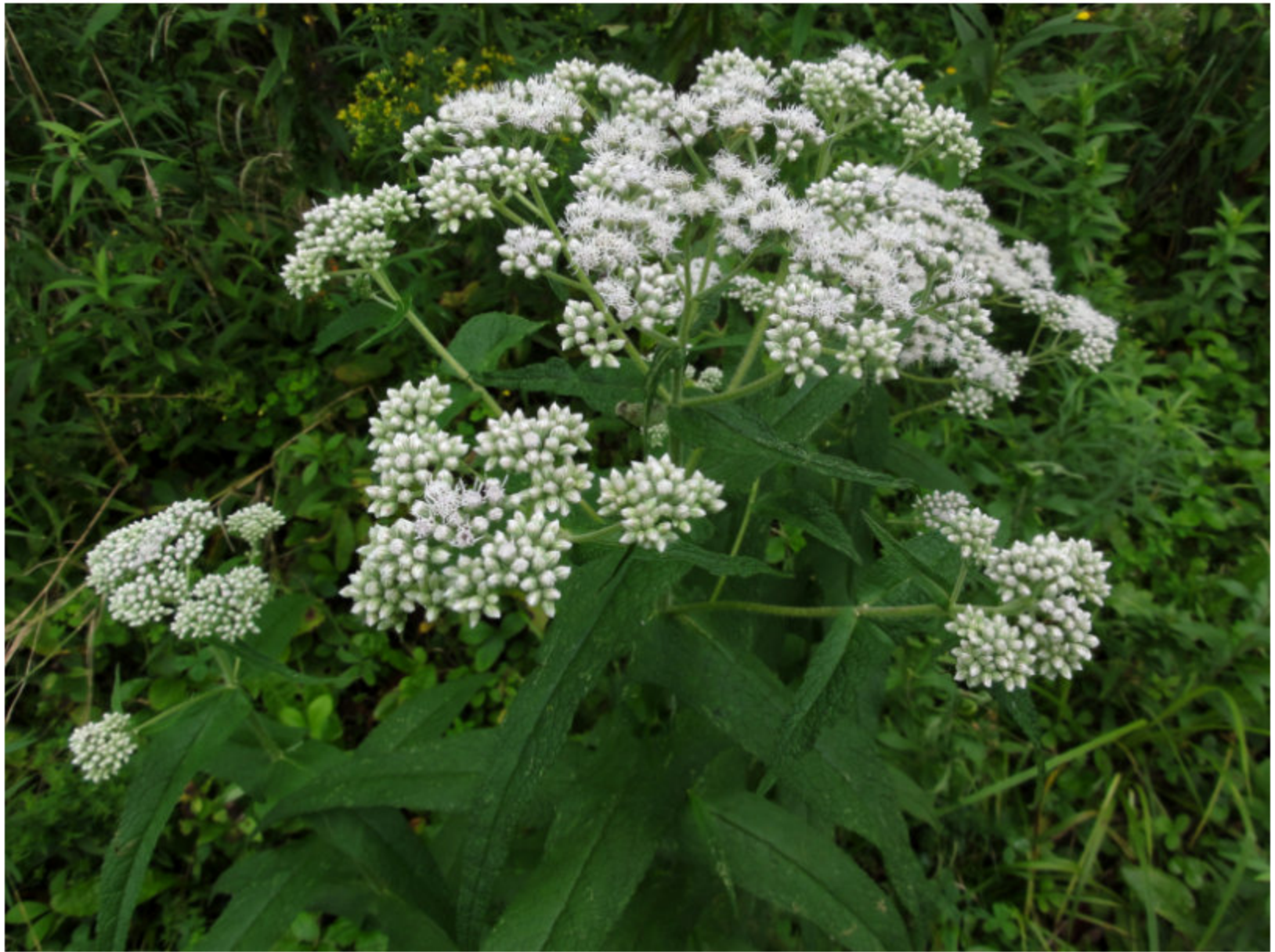
Eupatorium perfoliatum boneset