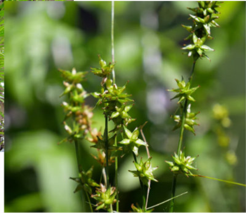
Carex rosea rosy sedge