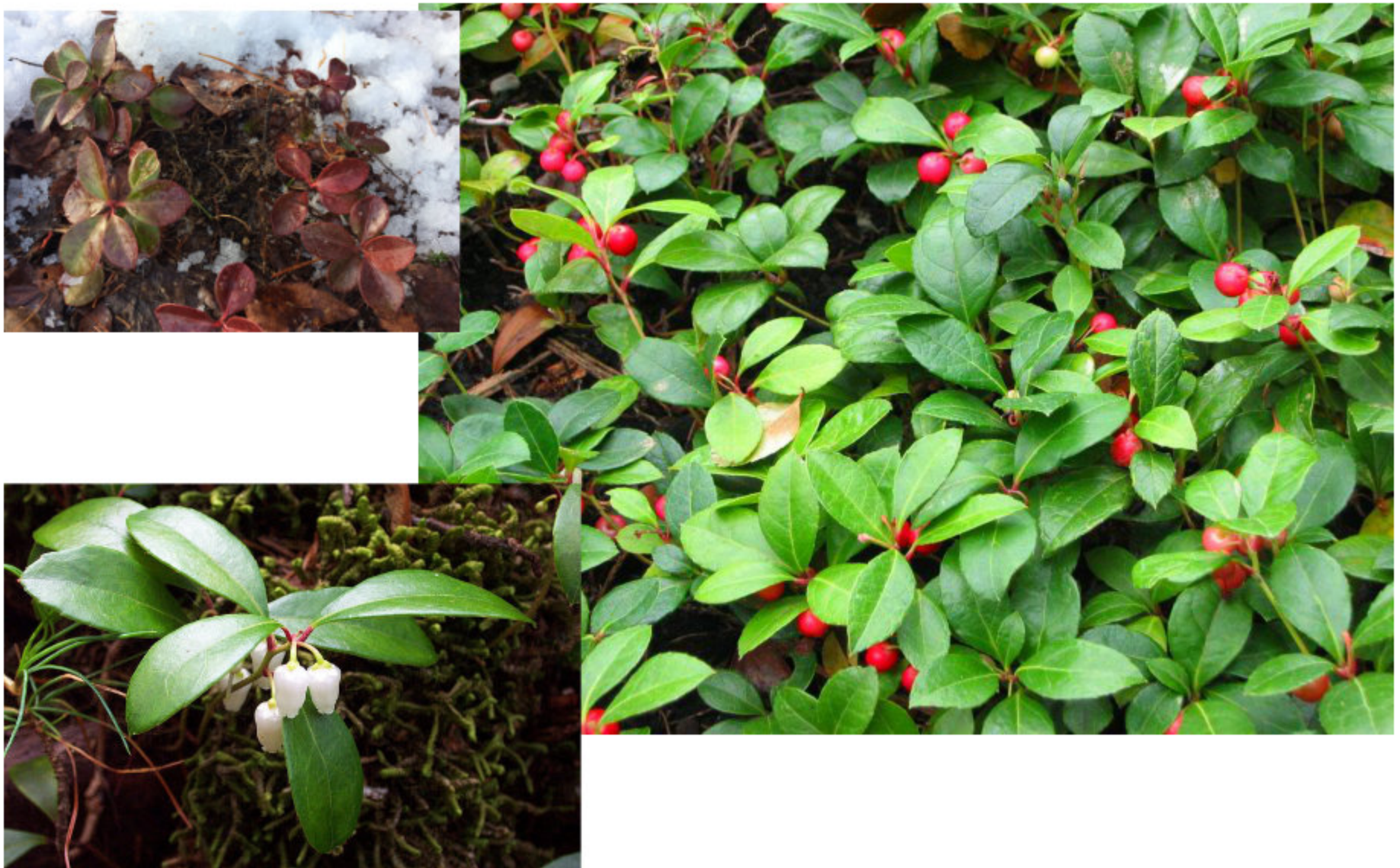
Gaultheria procumbens wintergreen