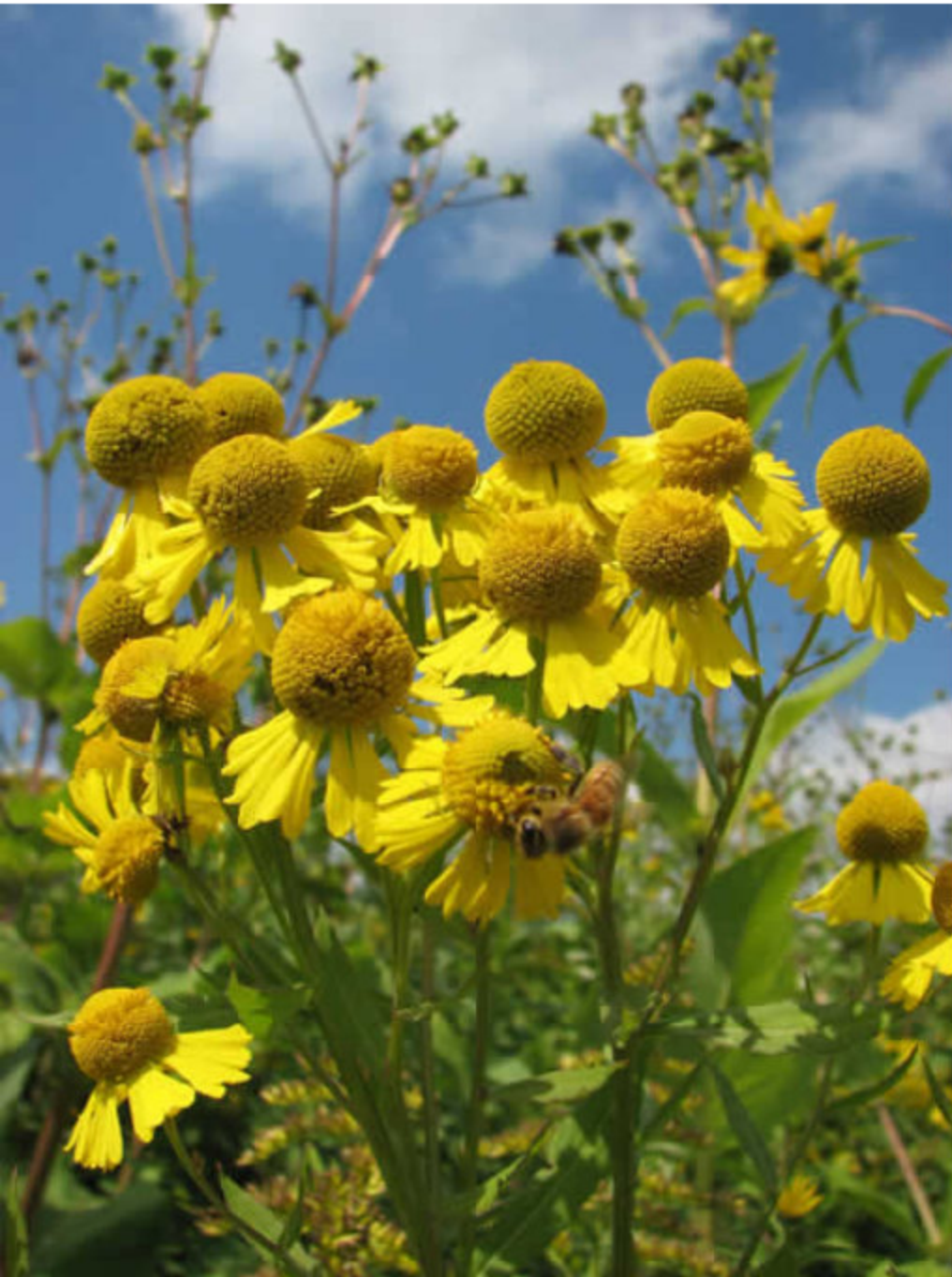
Helenium autumnale fall sneezeweed