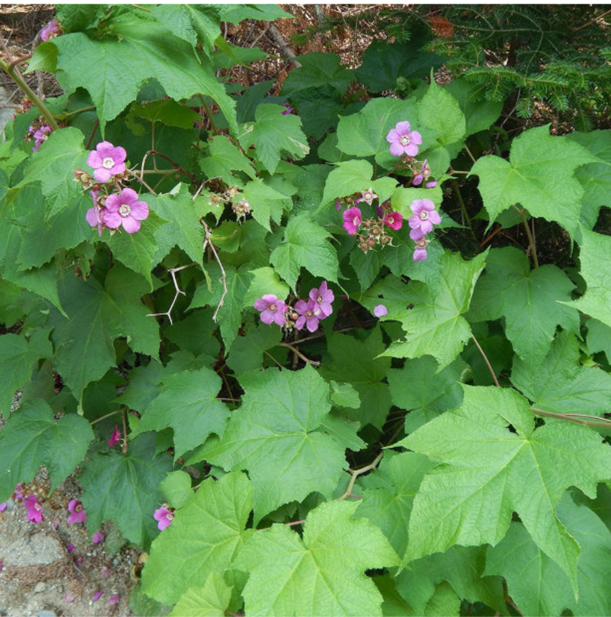
Rubus odoratus flowering raspberry