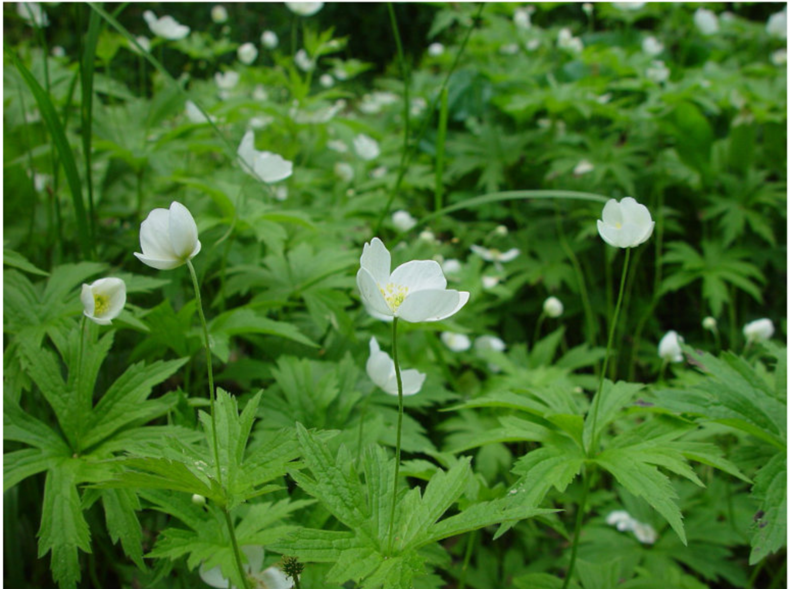
Anemone canadensis Canadian windflower