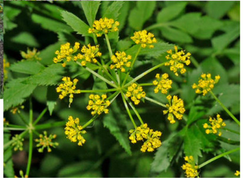
Zizia aurea golden alexanders