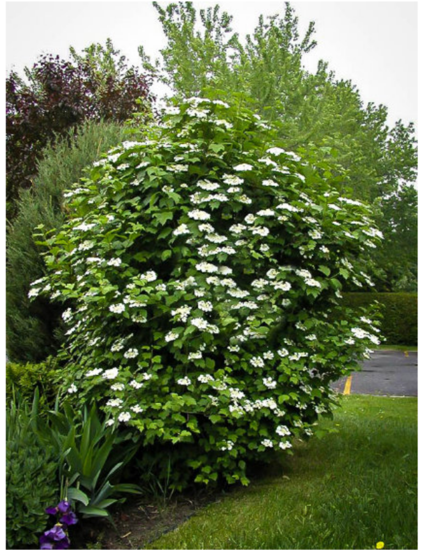
Viburnum opulus ssp. americana highbush cranberry