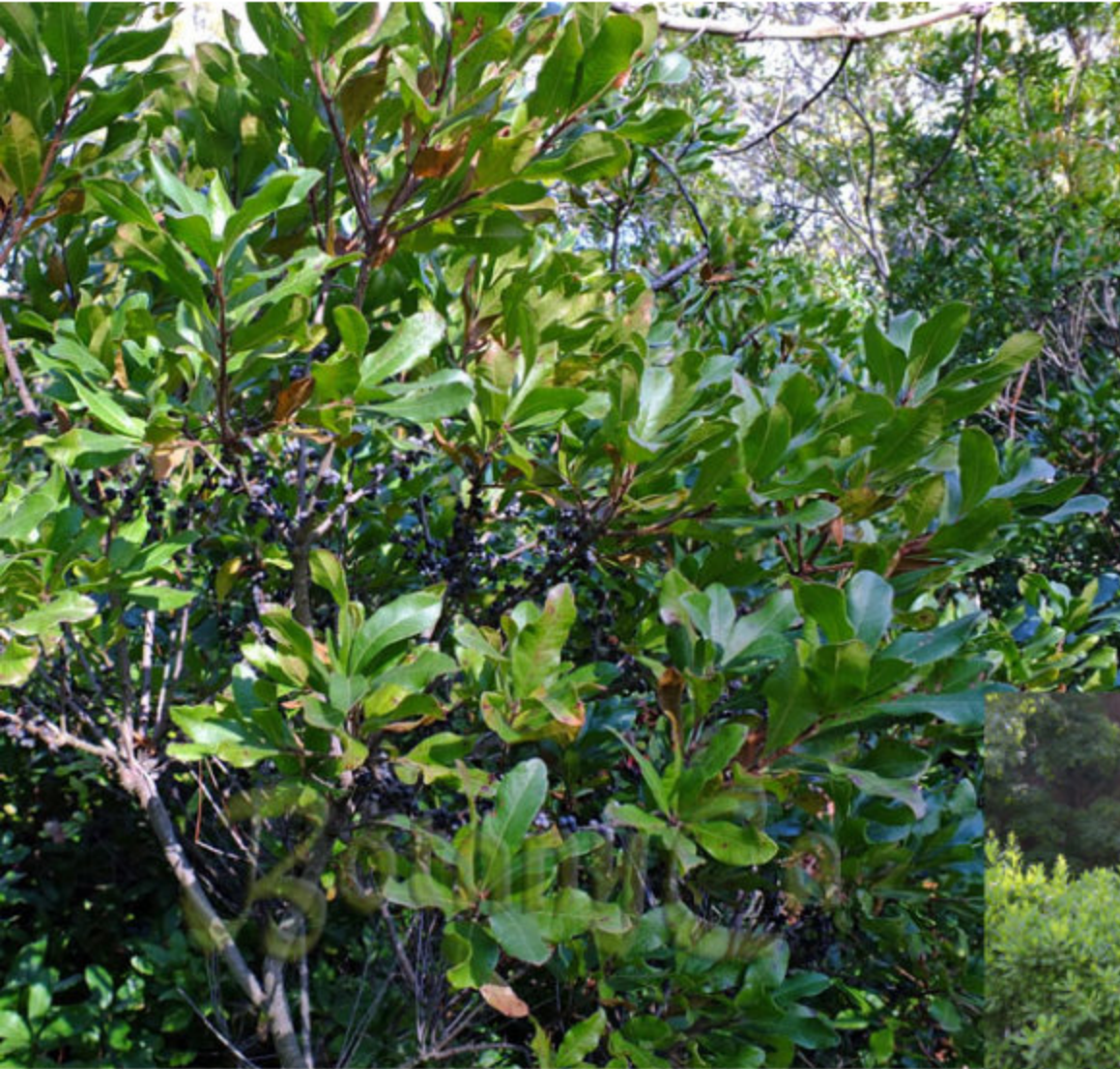
Morella caroliniensis bayberry