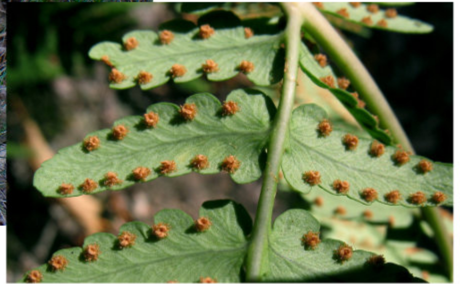
Dryopteris marginalis marginal wood fern