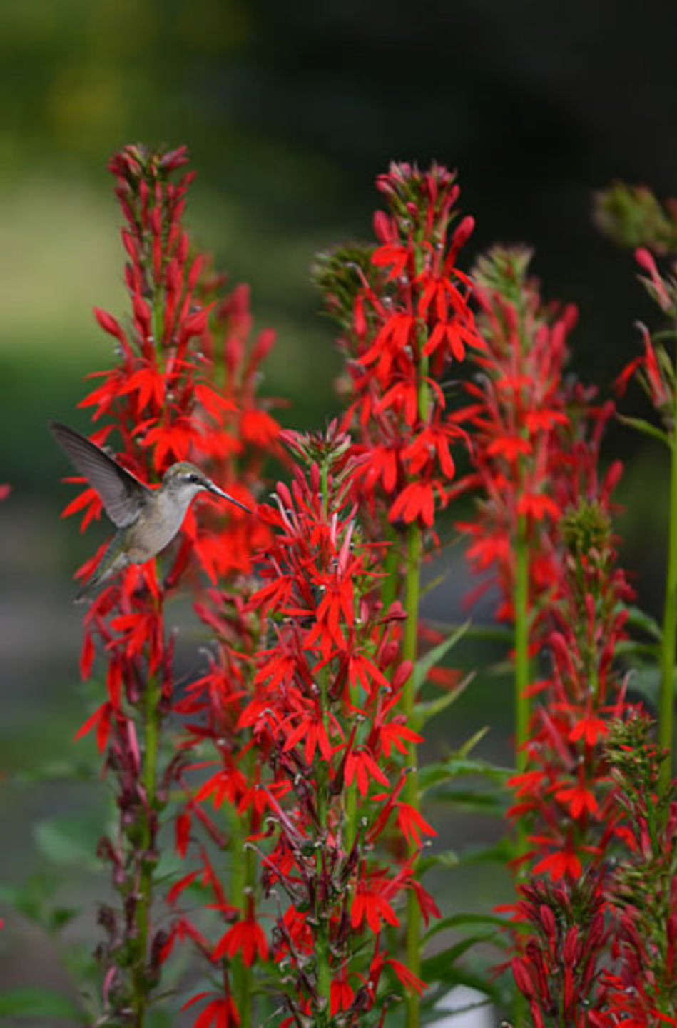
Lobelia cardinalis cardinal flower