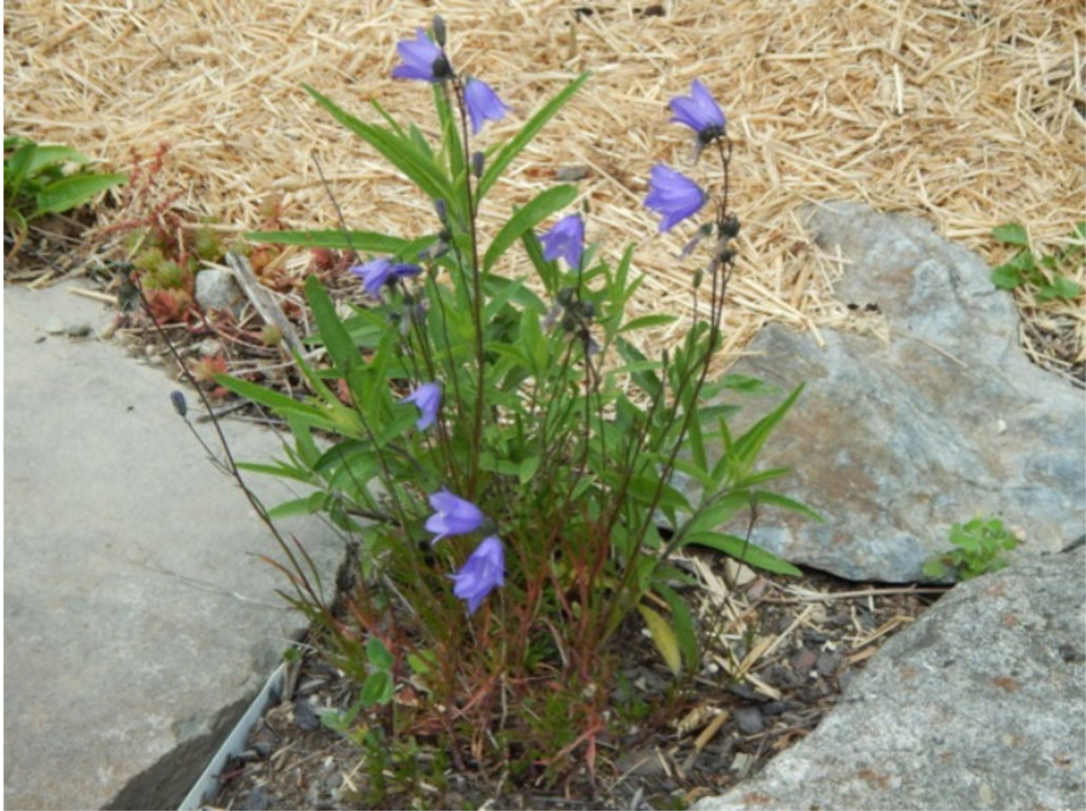
Campanula rotundifolia Scotch bellflower