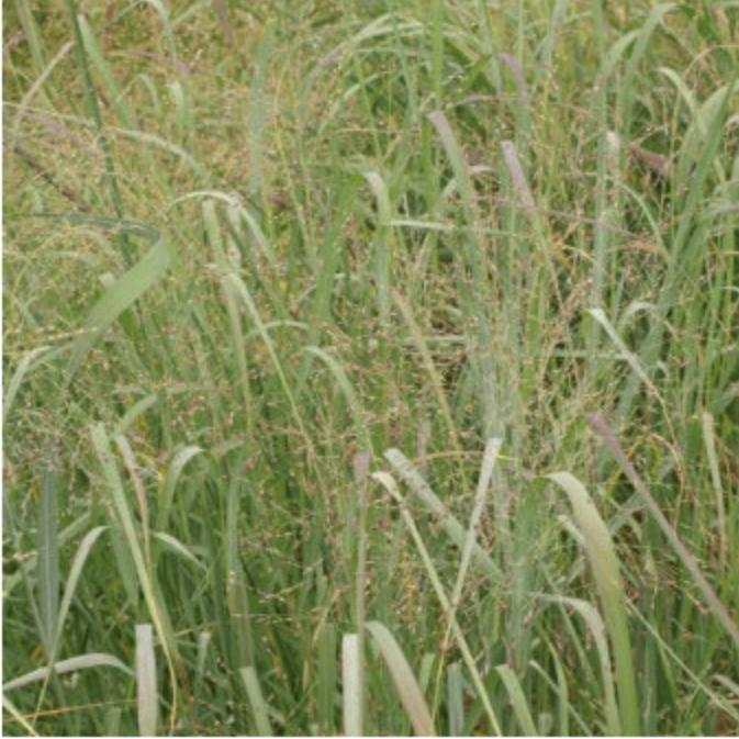
Panicum virgatum switch grass