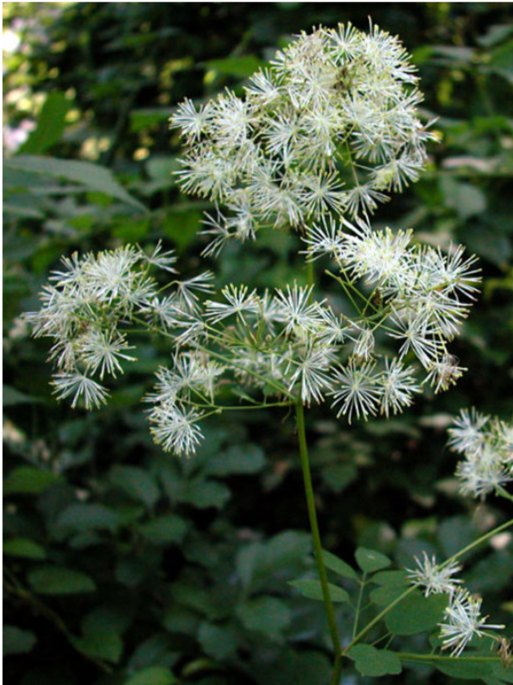
Thalictrum pubescens tall meadow rue