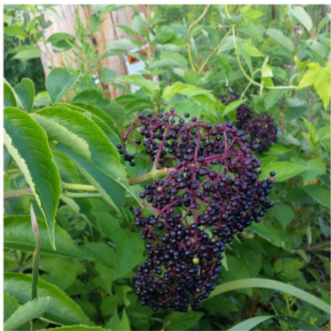
Sambucus nigra ssp. canadensis black elderberry