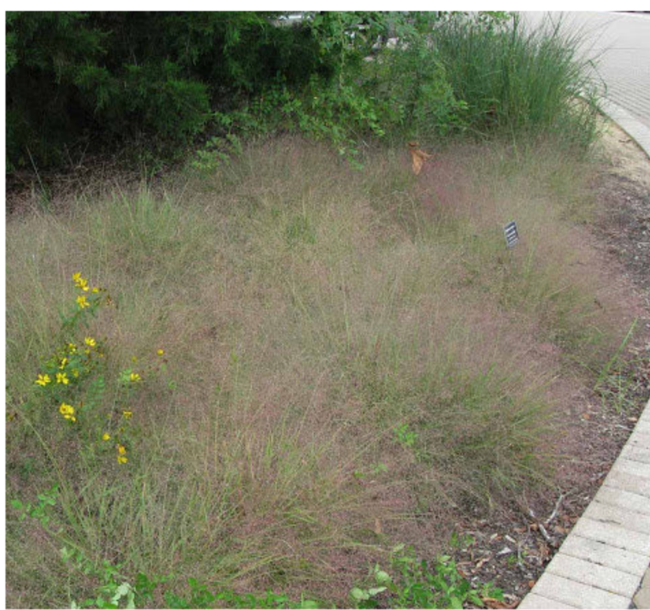
Eragrostis spectabilis purple love grass