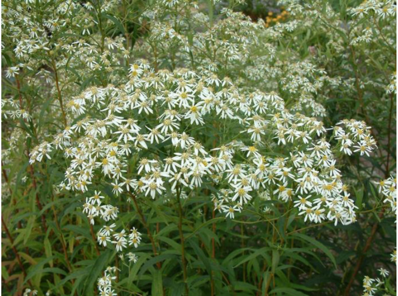
Doellingeria umbellata flat-topped aster