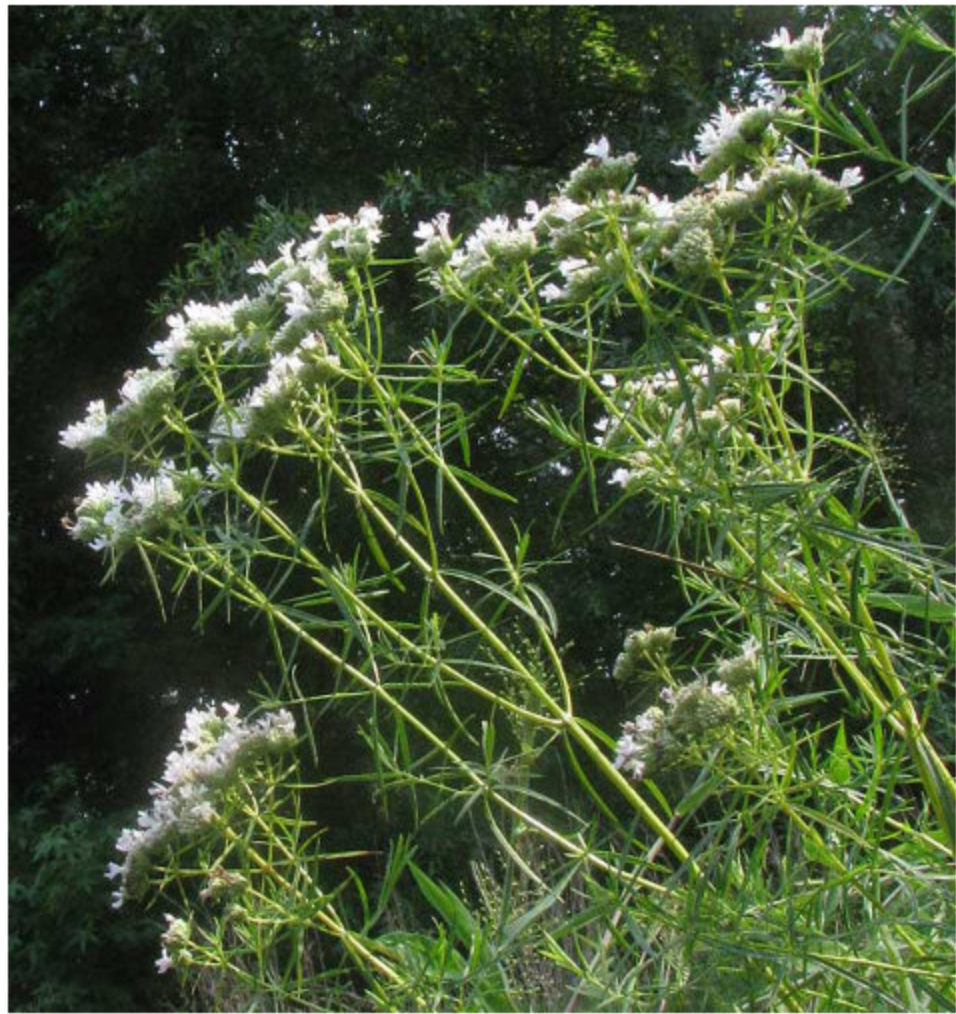
Pycnanthemum tenuifolium narrow leaf mountain mint