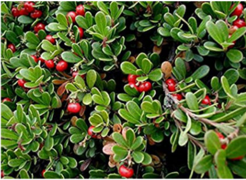
Arctostaphylos uva-ursi bearberry