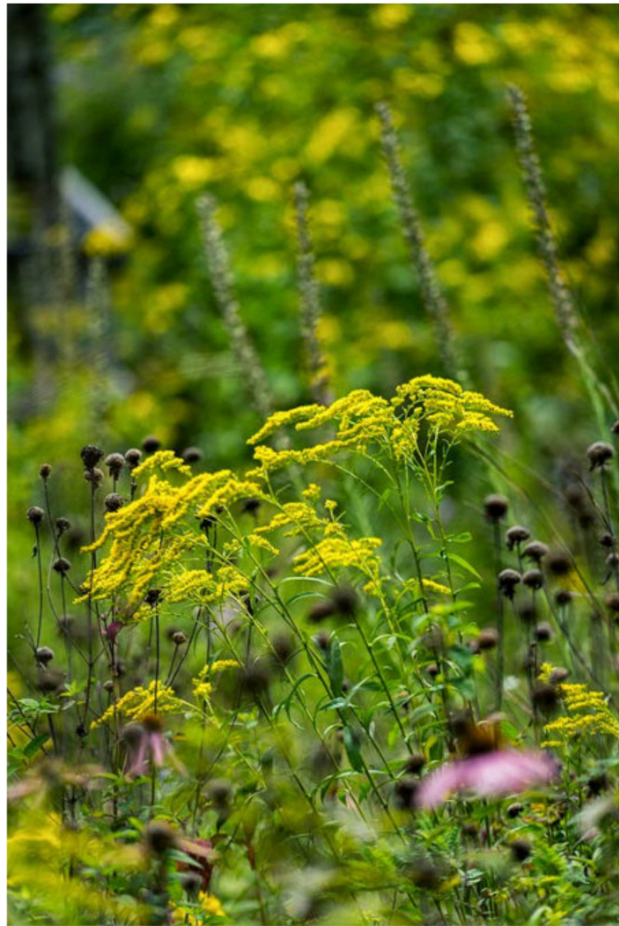
Solidago juncea early goldenrod