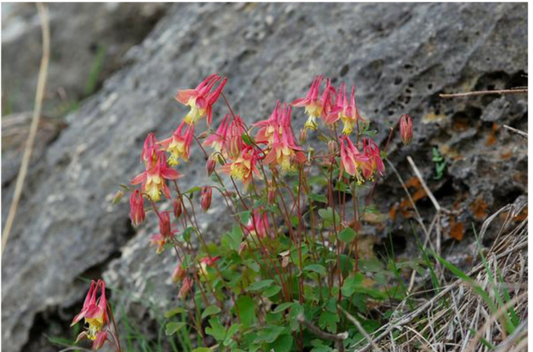
Aquilegia canadensis red columbine