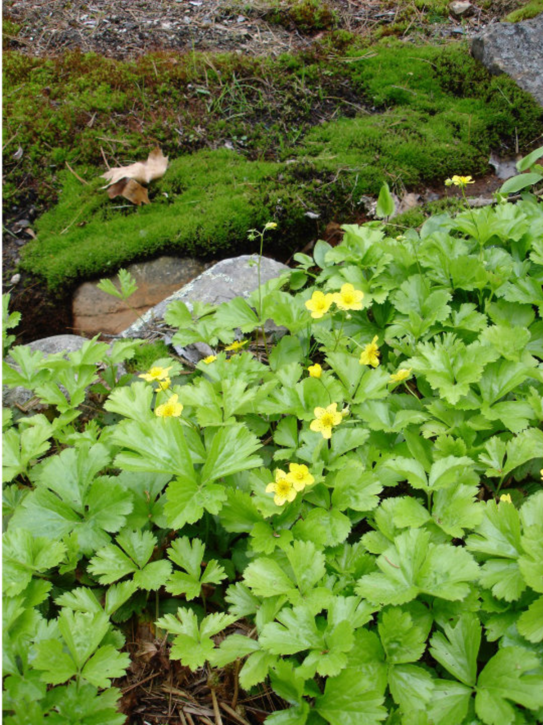
Geum fragarioides barren strawberry