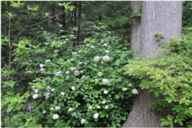
Viburnum dentatum arrowwood