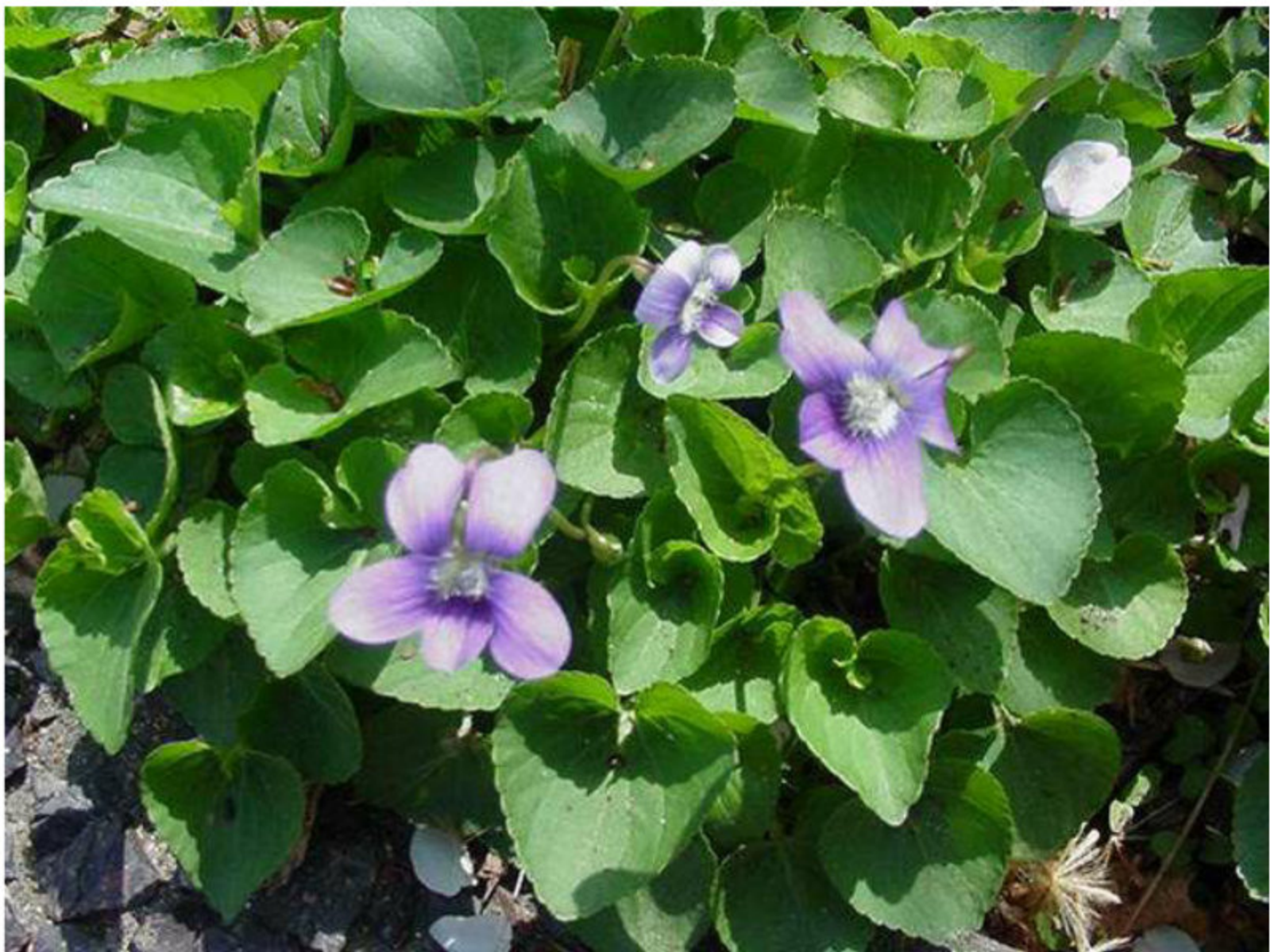
Viola sororia wooly blue violet