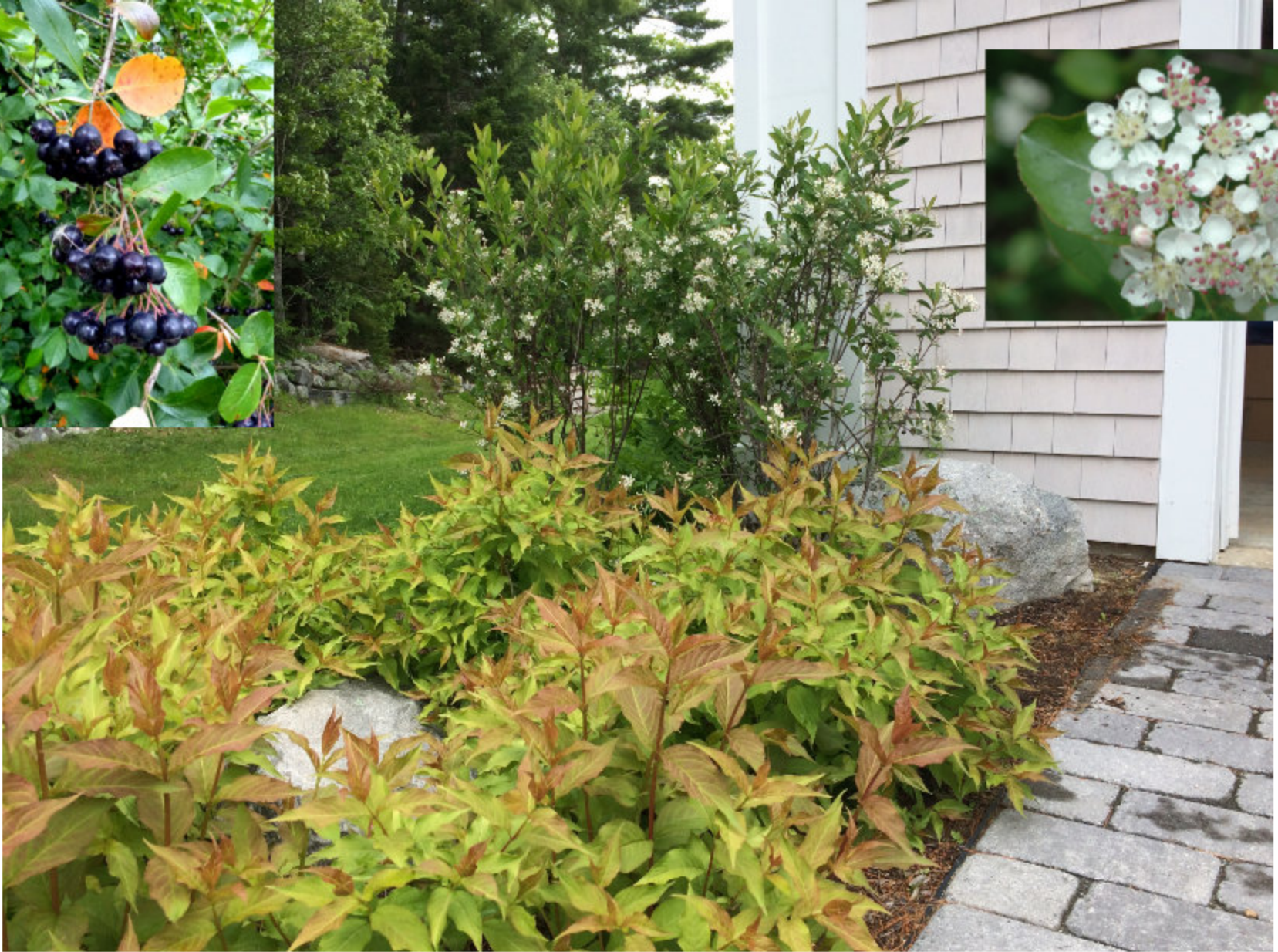
Aronia melanocarpa chokeberry