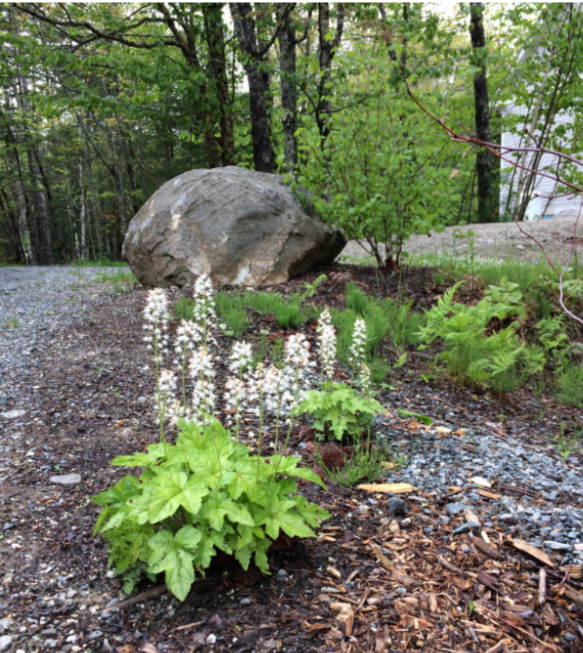
Tiarella cordifolia foam flower