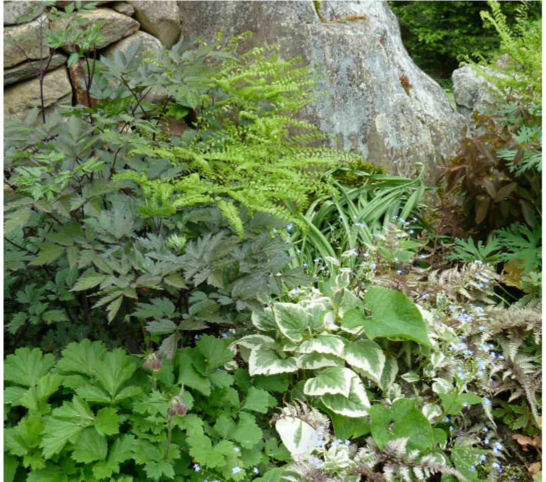
Adiantum pedatum maidenhair fern