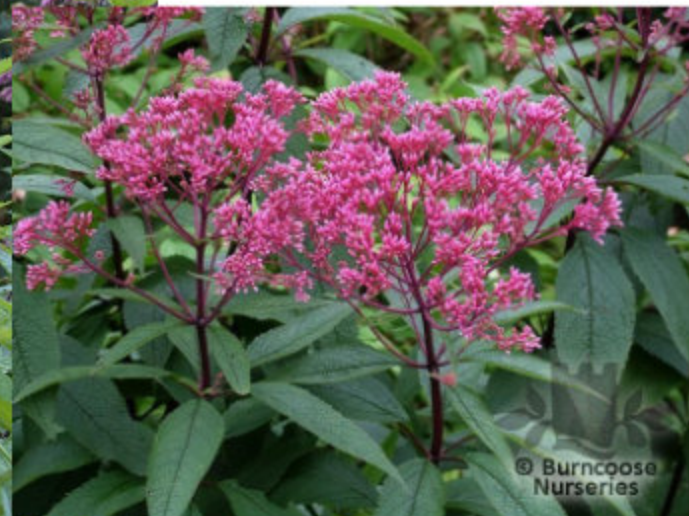
Eutrochium maculatum spotted Joe-Pye weed