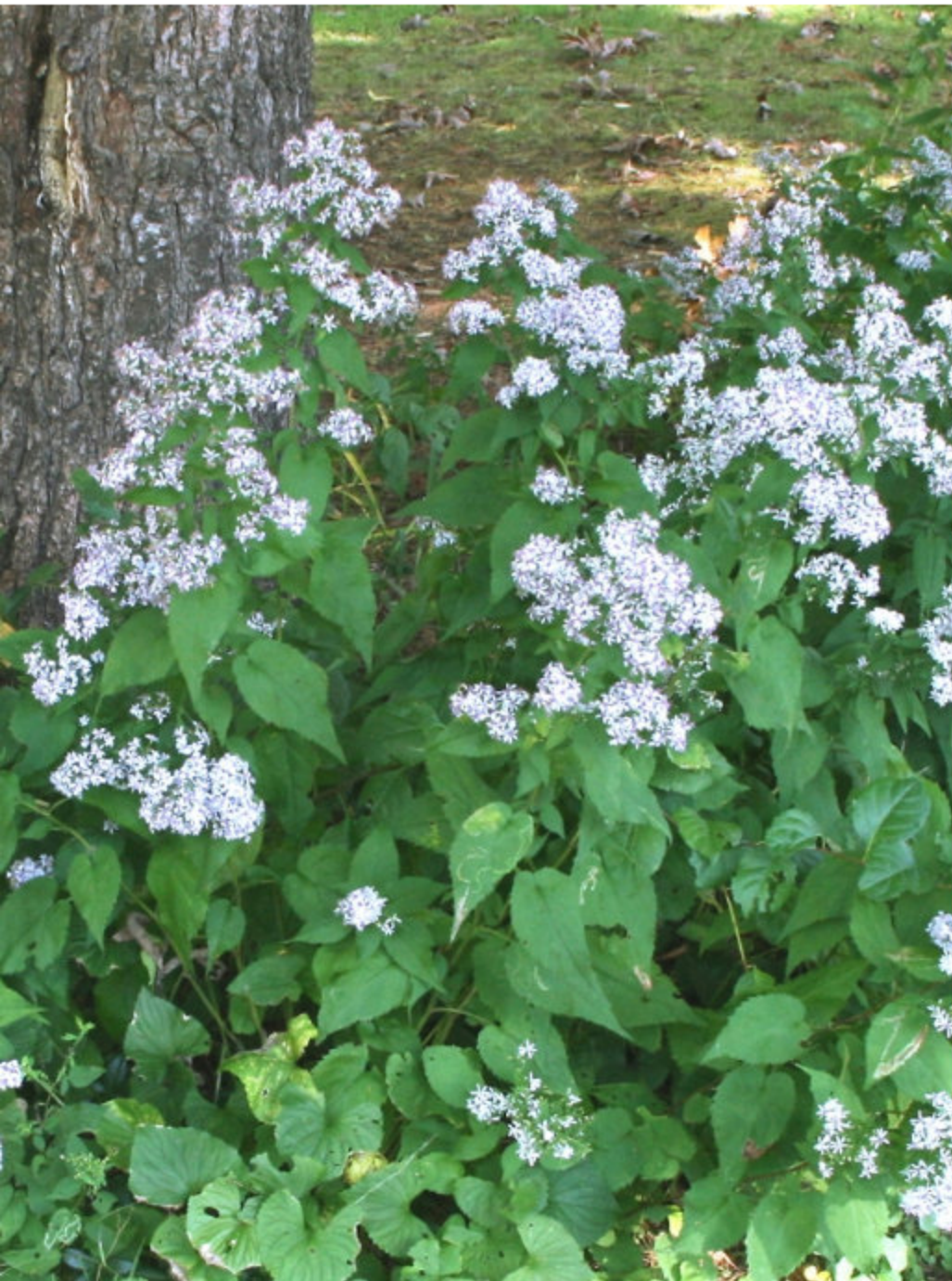
Symphotrichum cordifolium heart-leaved aster