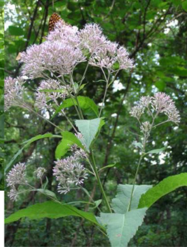
Eutrochium purpureum purple Joe-Pye weed