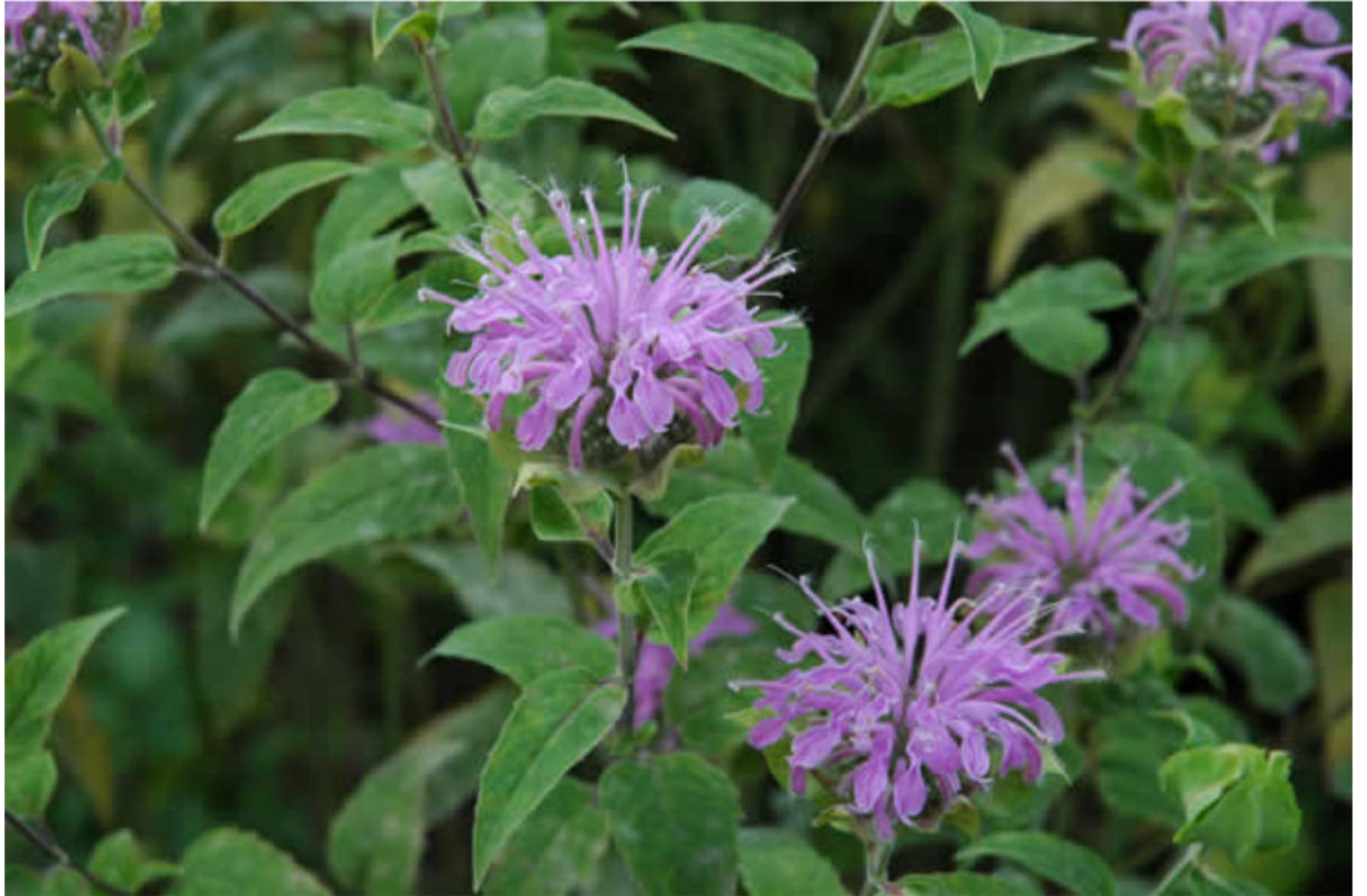
Monarda fistulosa wild bee balm