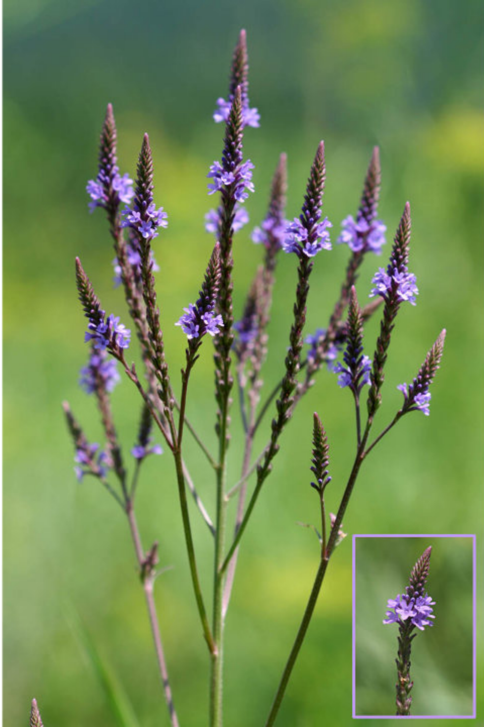
Verbena hastata blue vervain