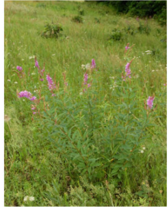
Desmodium canadense showy tick-trefoil