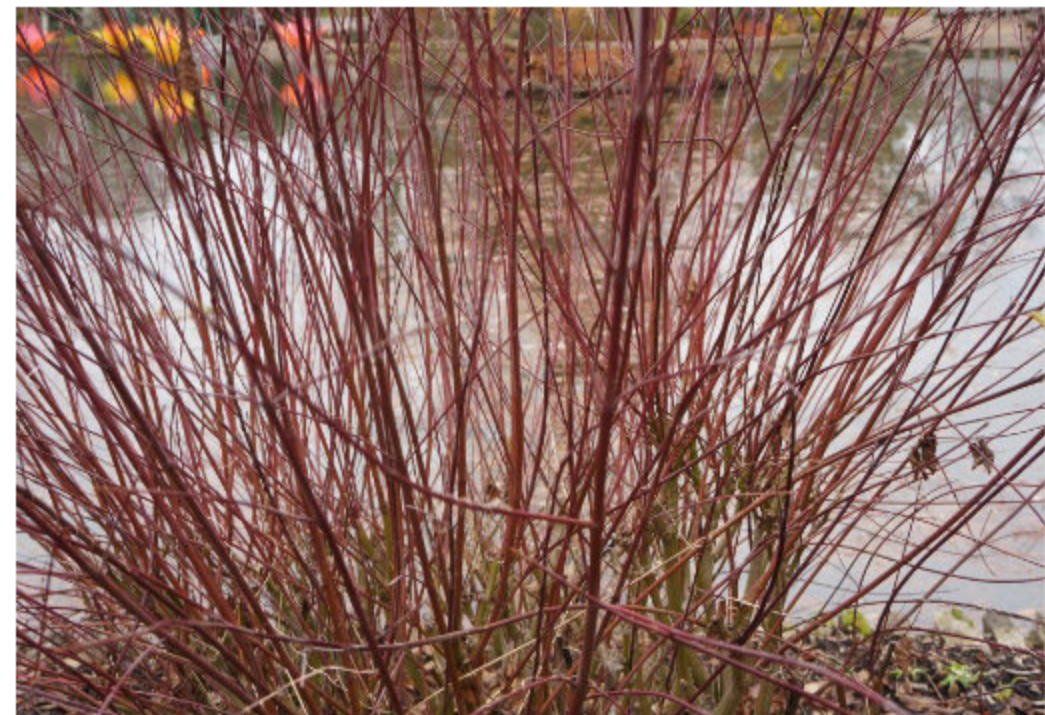
Swida amomum silky dogwood