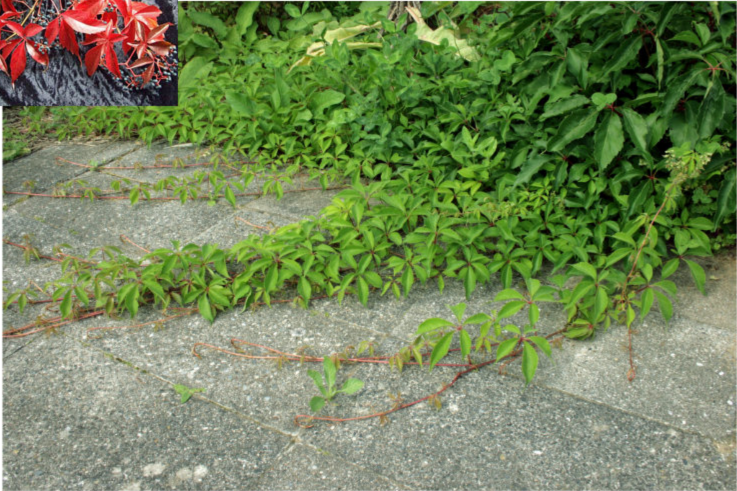
Parthenocisus quinquefolia Virginia creeper