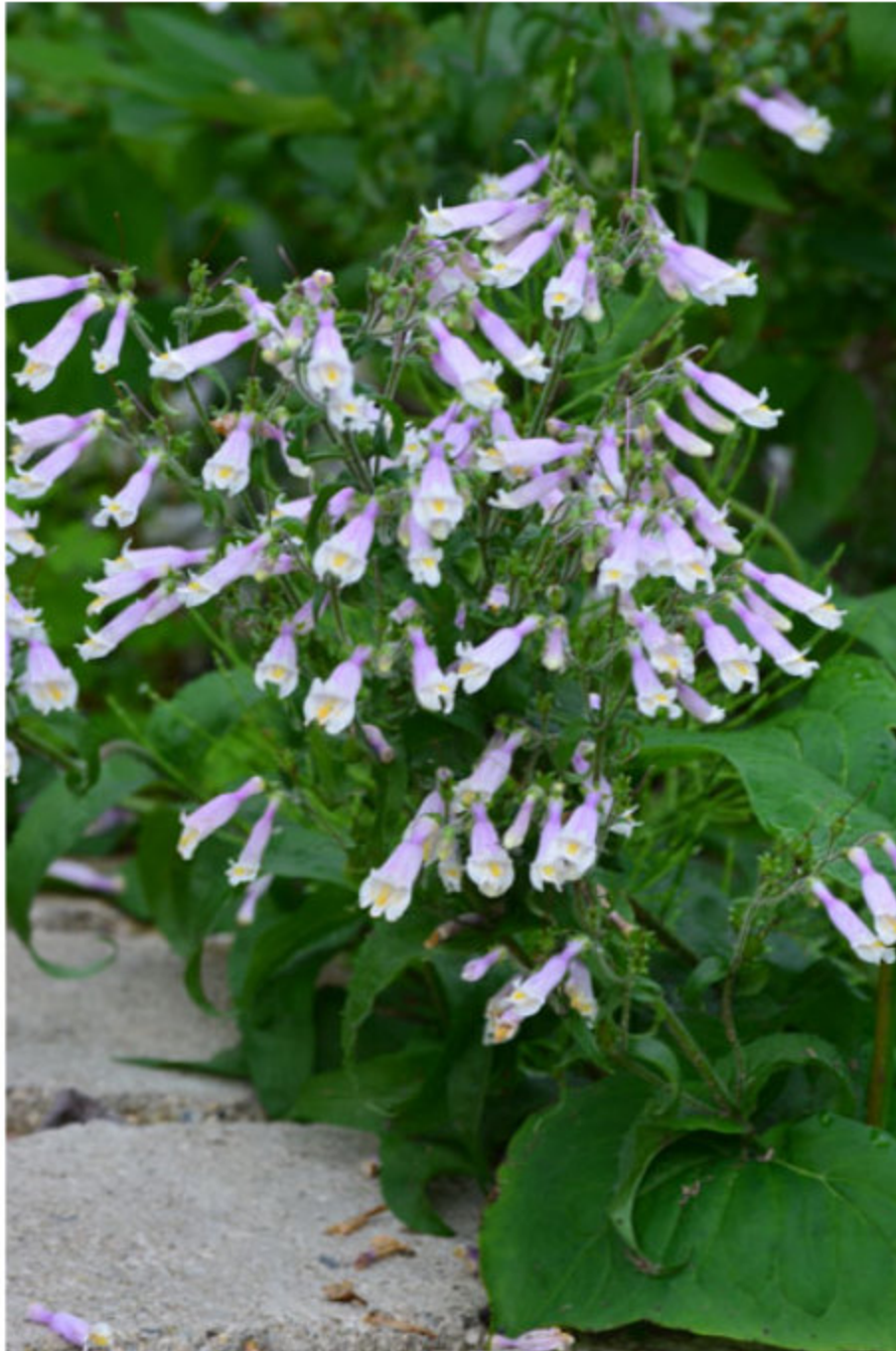
Penstemon hirsutus hairy beardtongue