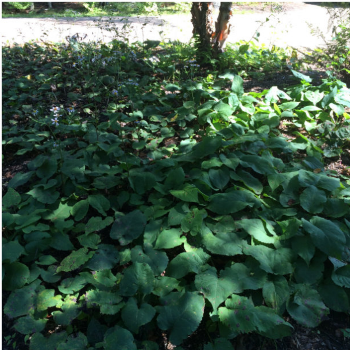
Eurybia macrophyllus large-leaved wood aster