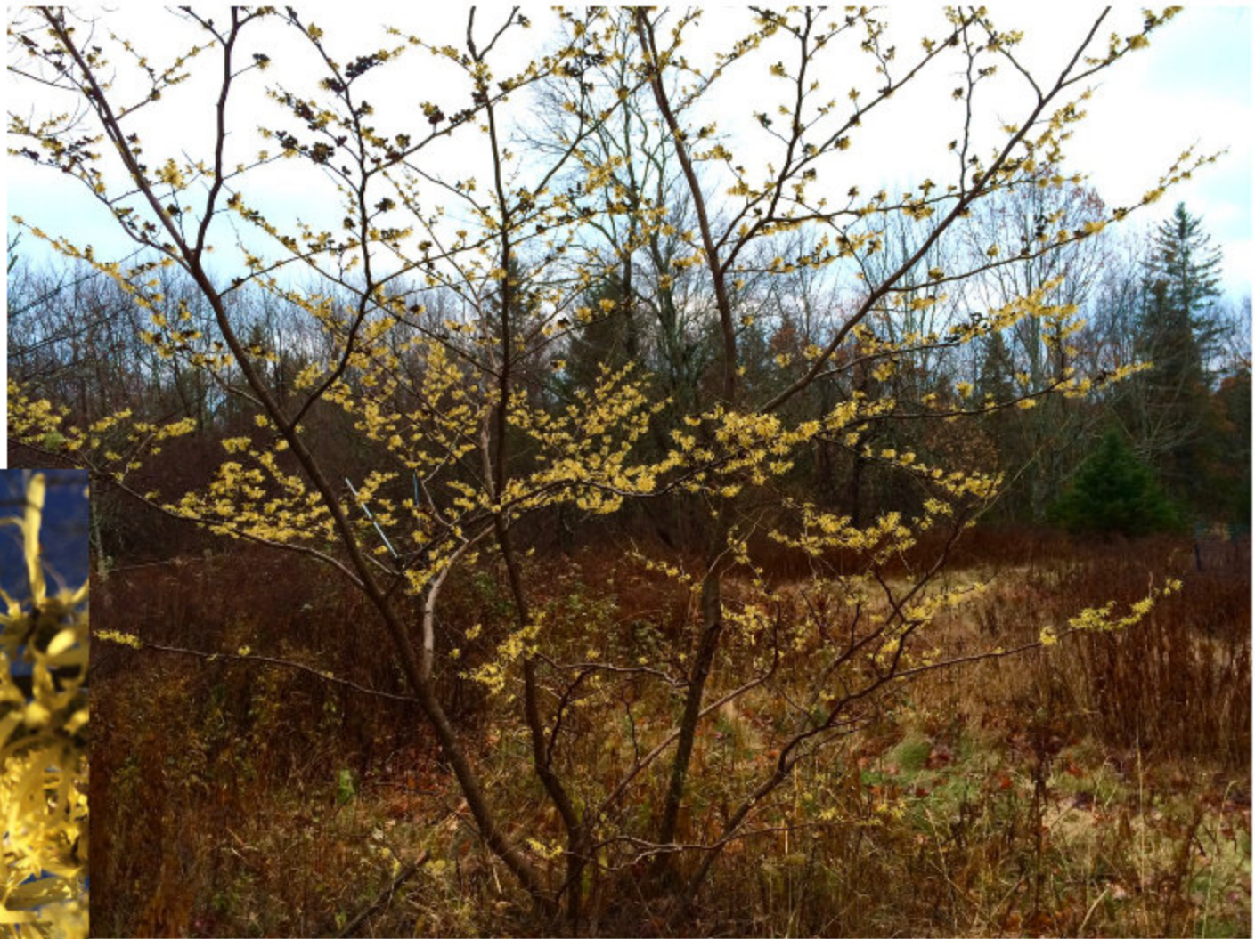
Hamamelis virginiana witch hazel