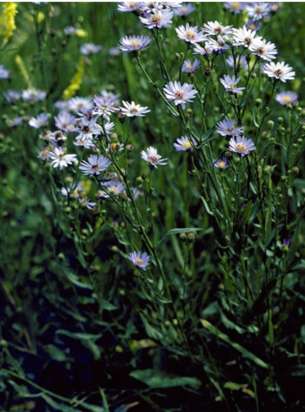
Symphotrichum laeve smooth aster