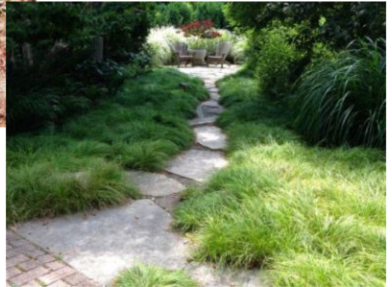
Carex pensylvanica pennsylvania sedge