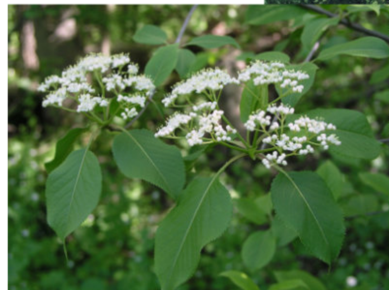
Viburnum lentago nannyberry