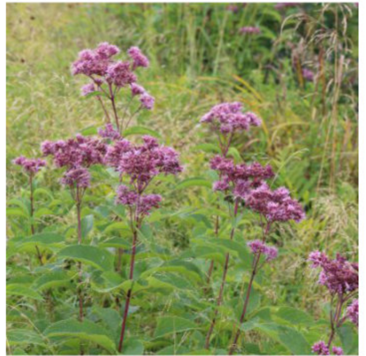
Eutrochium dubium coastal joe pye weed