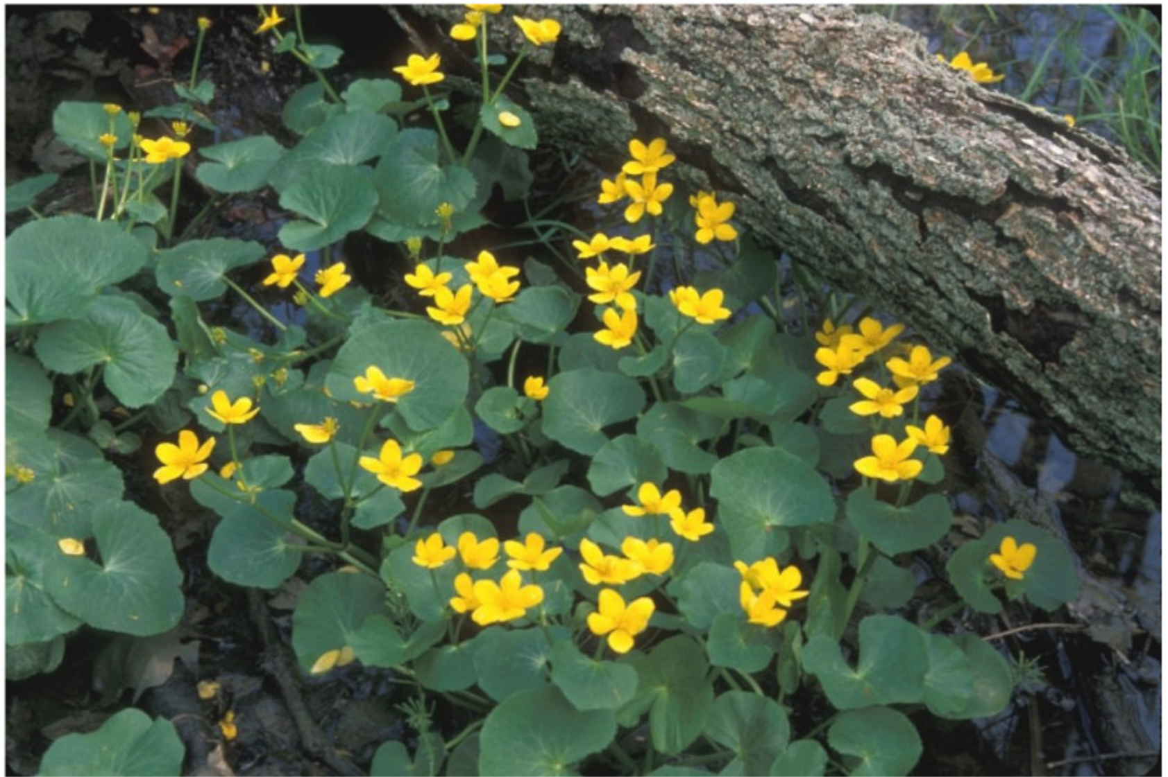
Caltha pulustris marsh marigold