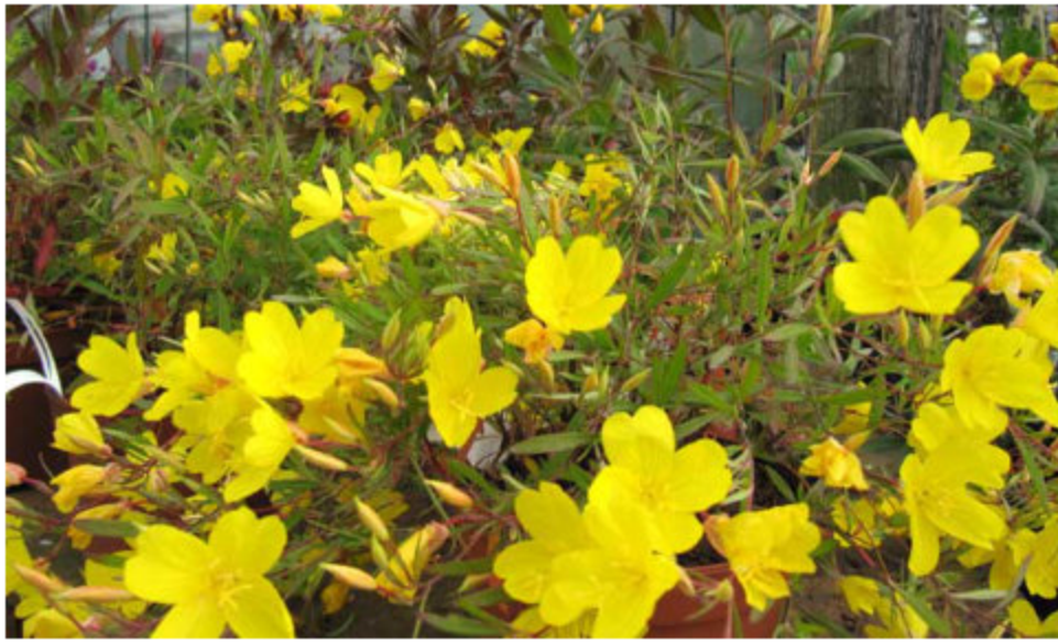
Oenothera fruticosa sundrops