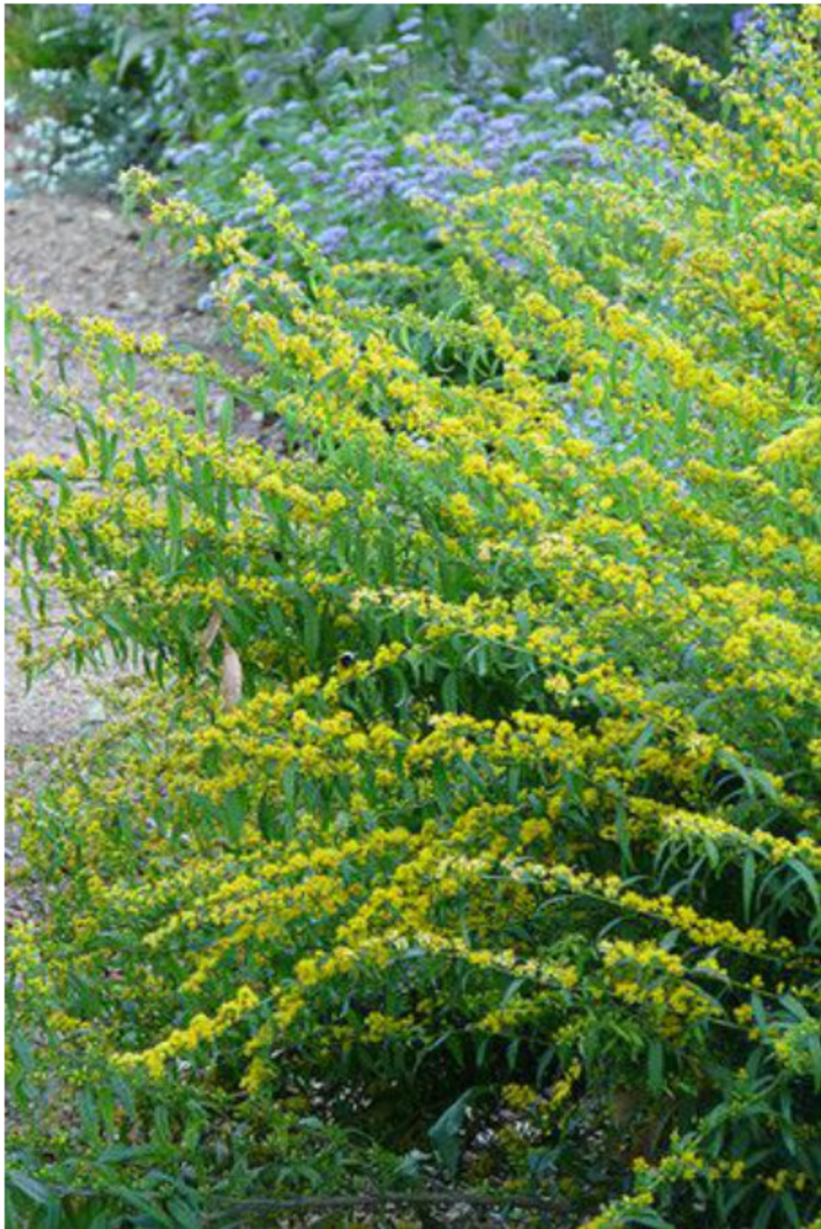
Solidago caesia axillary or blue-stemmed goldenrod