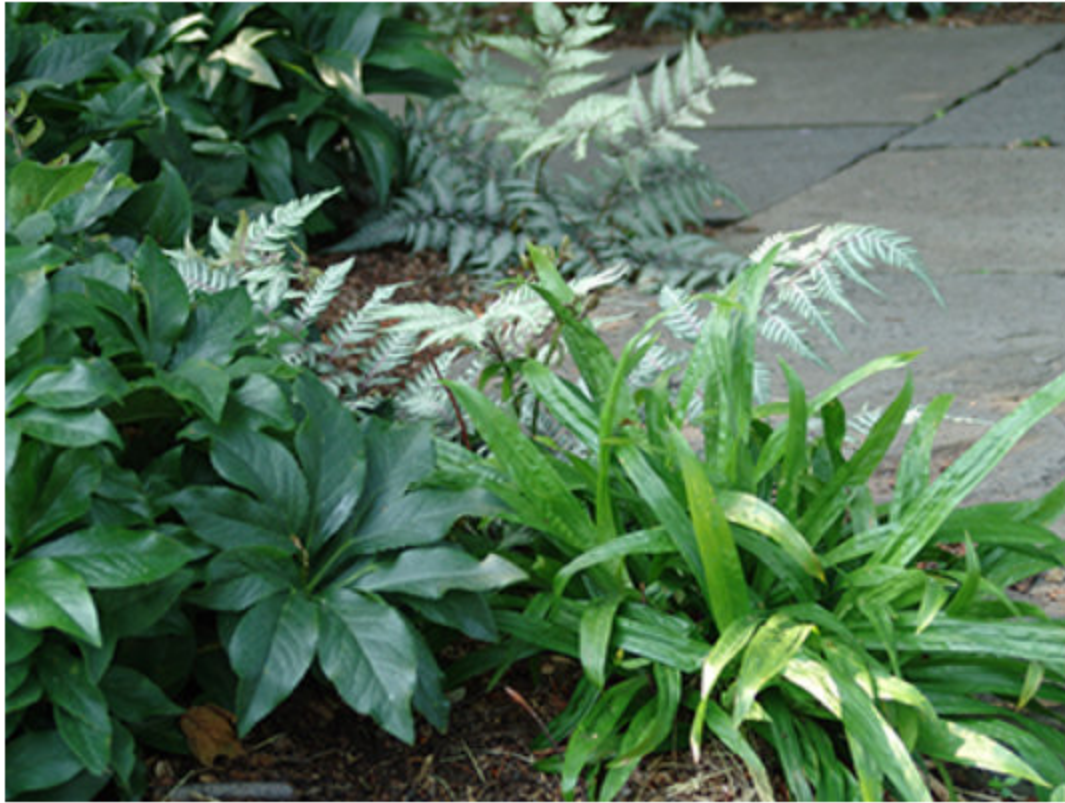
Carex plantaginea seersucker sedge